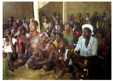
Tribal members learn about Jesus

Inreached Tribe Converting to Christianity: The first meeting was under a tree resulted in the tribal chief inviting us to start churches throughout the tribe. With each church we penetrate a little further into the deepest, darkest part of Africa remaining without the gospel. Formerly practicing ancient tribal religions and witchcraft, the people readily receive salvation when they understand the true sacrifice is Jesus and not animals, and that redemption is through forgiveness rather than works.